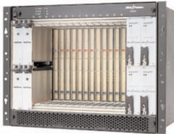
The C0814 is the first I-Bus enclosure to feature our fail-safe OptiCool™ design