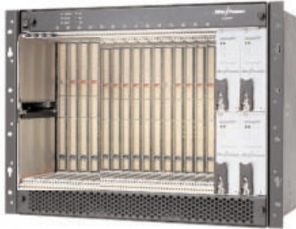
The C0817 is the first I-Bus enclosure to support up to 17x IBC2802 CPU boards