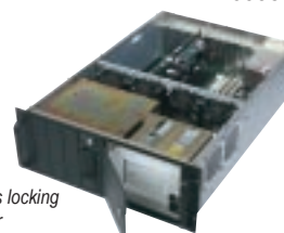
TR4SD shows locking drive bay door