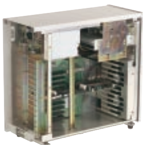
TT20 Tower - rear view Shows rear mounted floppy disk drive